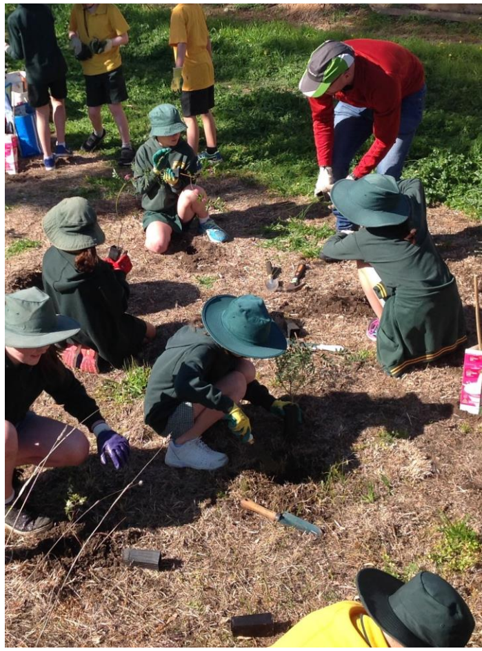
Left to Right: Plant propagation and revegetation activity by Leopold PS Students